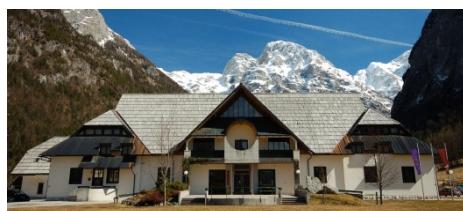
TNP Info Centre Dom Trenta Na Logu in Trenta SI-5232 Soča