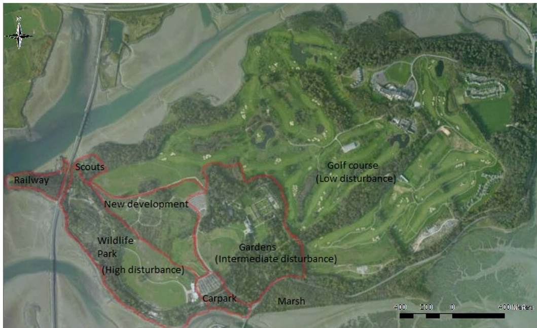
Fig. 1. The 315 ha of Fota Island displaying the main recreational areas of the island.

variations in stress levels between the different areas of the island and whether elevated stress levels were correlated with the greater public disturbance in the high disturbance area in comparison to areas of low public disturbance. When faecal matter was present, it was removed using forceps and placed in vials and labelled with the P.I.T. tag identification code of that squirrel. Faeces were only collected if that squirrel had not previously been caught in that trapping session, to eliminate recording elevated stress levels due to trapping. Samples were