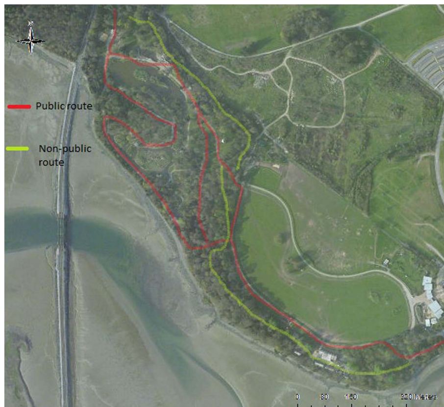
Fig. 2. Public and non-public transects walked through the wildlife park.

placed in freezer bags and frozen at -20\text{ }^{\circ}\text{C} a maximum of 4 h later. At the end of trapping in March 2014, samples were sent on dry ice to the University of Veterinary Medicine, Vienna and extracted as previously described in detail (Touma et al., 2003; Dantzer et al., 2010; Dantzer et al., 2011; Palme et al., 2013). FCM were analysed with a 5\alpha -pregnane- 3\beta , 11\beta , 21 -triol- 20 -one enzyme immunoassay (EIA) which measures glucocorticoid metabolites with 5\alpha - 3\beta , 11\beta -diol structure (Touma et al., 2003). This EIA has been successfully validated in