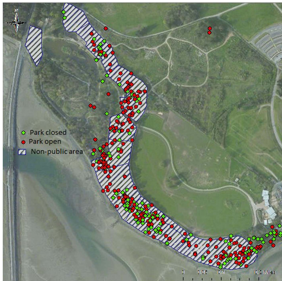
Fig. 3. Radio tracking fixes (n = 481) from March 2013–March 2014, showing the squirrels locations during visitor times and when the park was closed.