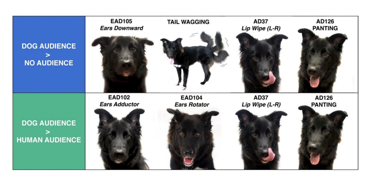
Figure 1. Behavioural variables that were more likely to occur 1st row: in the Dog partner compared to the Non-social condition and 2rd row: in the Dog partner compared to the Human partner condition.

Table 2. Results of the post-hoc analysis on the likelihood of occurrence of the behavioural variables in the three test conditions. Significant values are in bold.